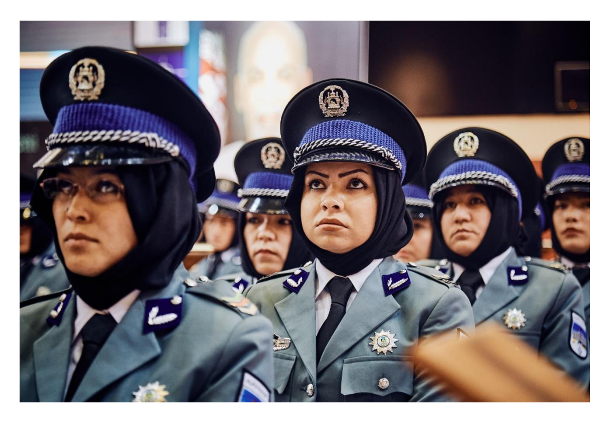
250 Police women return from their training in Turkey by UNDP / Igor Ryabchuk / 2017