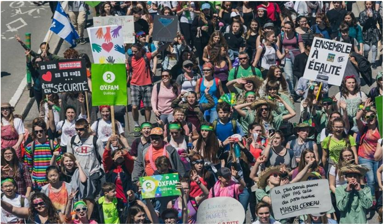
Photo: Ulysse Lemerise/Oxfam-Québec. Marche Monde, Montreal 6 May 2016.