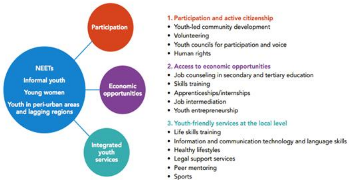
Figure 2: Multidimensional Policy for Youth Inclusion

local level. Such a holistic approach could help promote greater equity for youth and facilitate their meaningful participation in economic life.