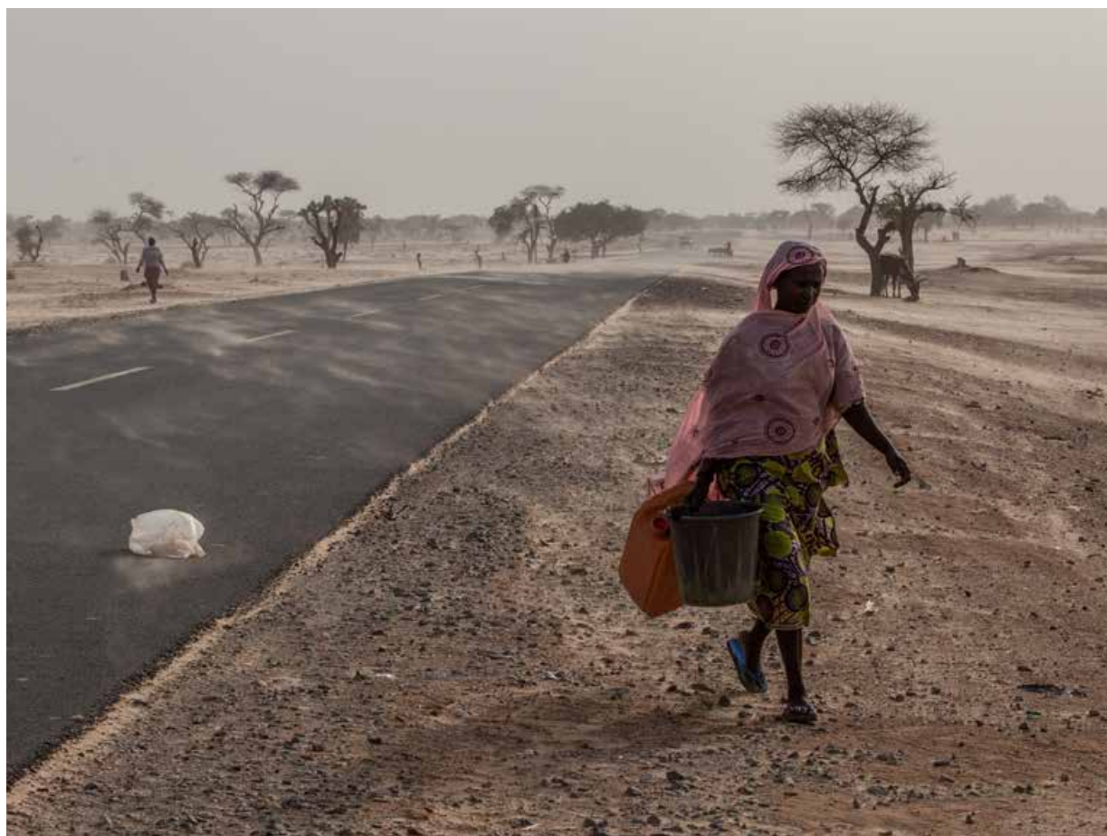
An IDP woman fetching water, from Camp Assaga, Diffa region, Niger.