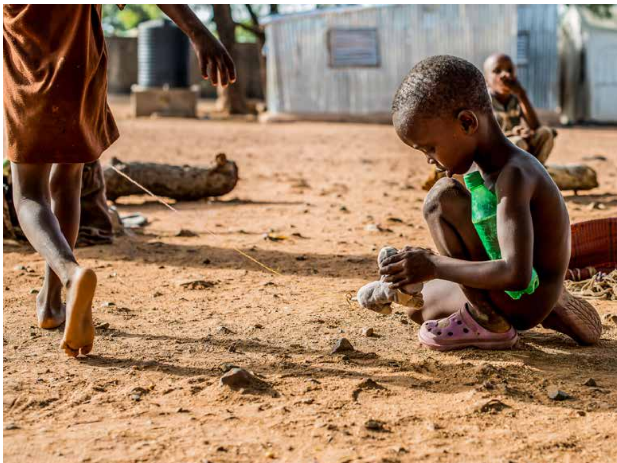
Child playing at St Theresa Catholic Church, Yola, Nigeria.

and curfews. Newly accessible areas in north-east Nigeria can only be accessed through the use of armed escorts, which makes it difficult for many humanitarian agencies to provide assistance as being associated with the military may put staff and beneficiaries at risk.