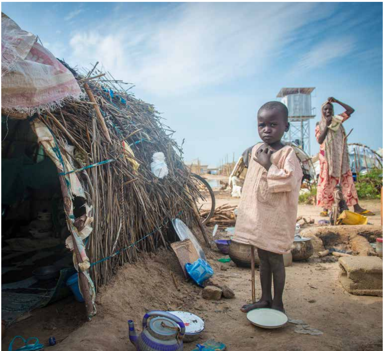
Farm Centre IDP camp is a government run camp in Maiduguri, the capital of Borno State, where over 13,000 IDP families live. It is a camp established by IDPs themselves when they moved in to empty unfinished buildings the government was building for government workers. There are also people living in makeshift shelters, especially people who have arrived more recently. Oxfam is providing water, latrines and sanitation activities in the camp.

Oxfam is in Nigeria, Niger and Chad for the long haul, working to empower communities to rise out of poverty, address food shortages and limit the impact of disasters. In response to the humanitarian crisis in the Lake Chad Basin, we have been working with local partners to provide much needed water, sanitation, hygiene, food and livelihood support. We also provide specialist support to women and other vulnerable groups to address their specific needs. Since the start of the crisis, Oxfam has provided assistance to nearly 200,000 people and aims to reach over one million people by the end of 2017.