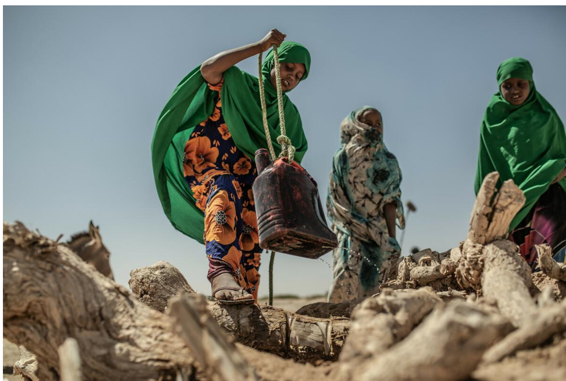
Women and girls often walk long distances to fetch water during droughts. Somali girls collect water from a well in Docoloha village, Somaliland.

Deep existing inequalities mean that small-scale producers, who produce more than 70% of the food consumed for people living in Asia and sub-Saharan Africa 65 , and the more than 1.7 billion people working on farms, plantations, fishing boats and in processing factories 66 , are often unable to produce enough food, or earn enough income, to escape hunger and poverty.