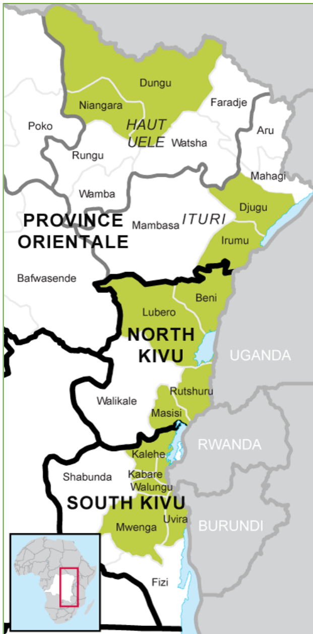
Map of eastern DRC showing the areas in which Oxfam's 2012 protection assessment was carried out