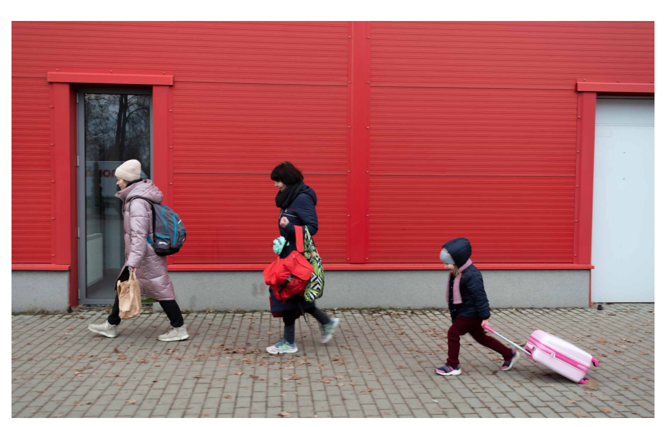
Family from Kharkiv, Ukraine, fleeing the war, pictured at the Hallo Kijowska reception center for refugees from Ukraine in Korczowa, Poland.