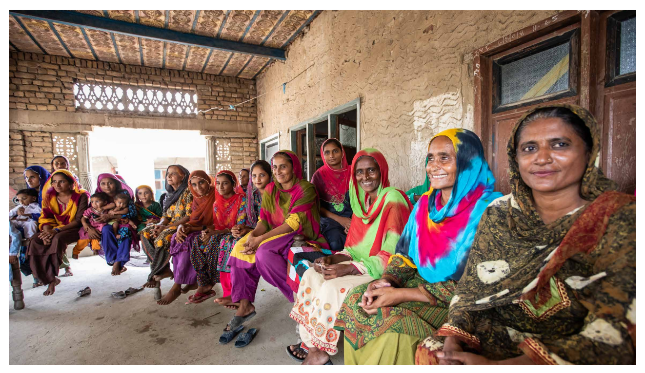
Women community leaders in Hyderabad, Pakistan.

How prevailing economic policy choices are a form of gender-based violence