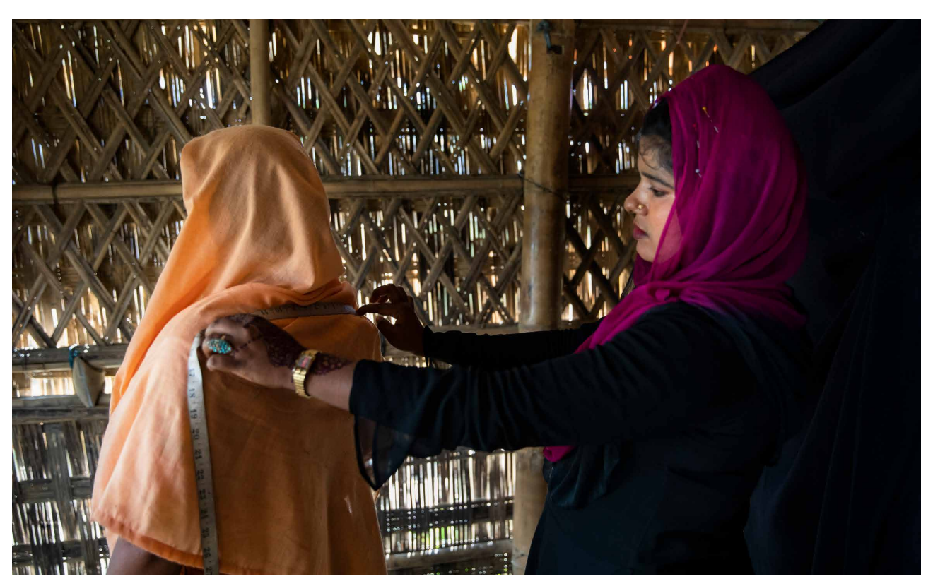
This picture was taken as a part of a project at Cox's Bazar, where Rohingya refugee women were supported to create new designs to overcome pre-identified water, sanitation and hygiene issues. The project aims to showcase how stronger collaboration with refugees can create facilities that are more appropriate in terms of gender, culture, safety and dignity.