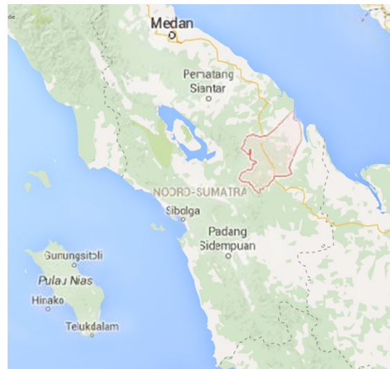
North-Sumatra - Labuhanbatu Utara

The overall advice we were given at the end of the workshop, regarding project locations, and with that, the local crises to tackle, was not to go safe but rather to go far. This strengthens our willingness to keep a high ambition level. For more elaborate information about the co-creation workshop go to the 'READ MORE' section on www.oxfamnovib.nl/fair-company-community-partnerships