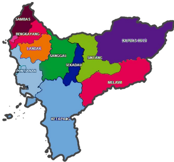
West-Kalimantan - Sekadau

Several potential project sites were discussed during the workshop, among which the two test-locations that CSOs had assessed: Sekadau (West-Kalimantan) and Labuhanbatu Utara (North-Sumatra). A deeper dive into these two and three other locations - notably Siak, Pelalawan, Bengkulu - will follow.