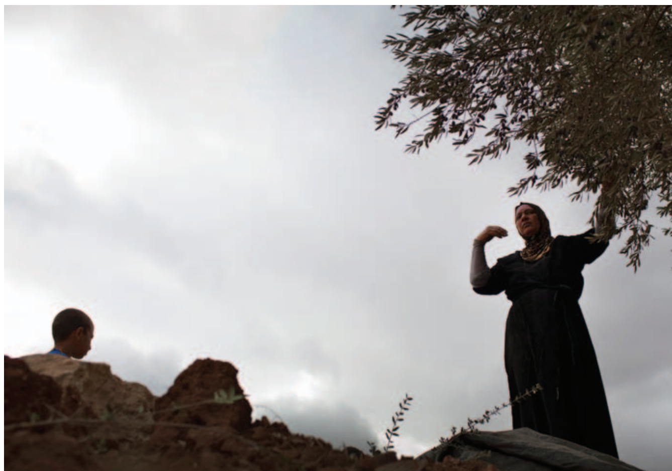
Women and child in Israel/Palestine with the symbolic olive tree. © David Levine