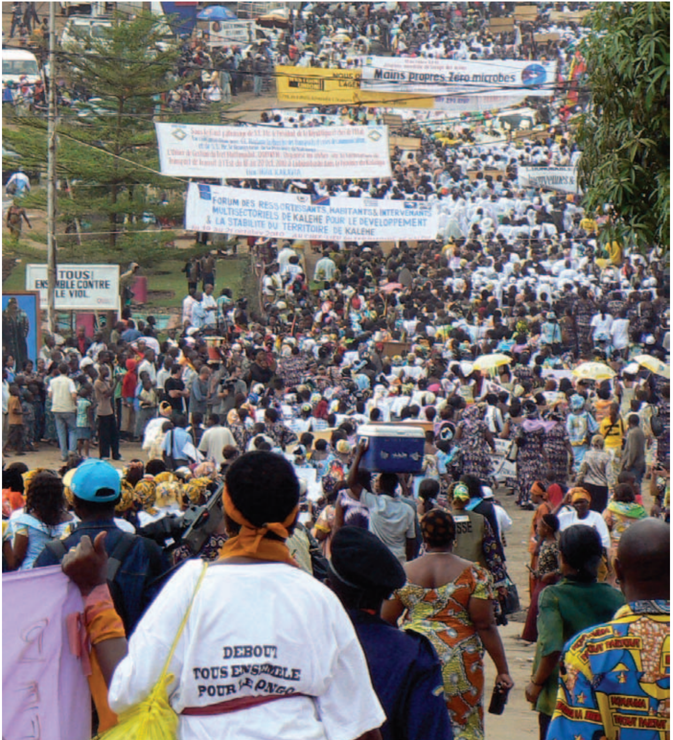
2010 Peace March in the Democratic Republic of the Congo.