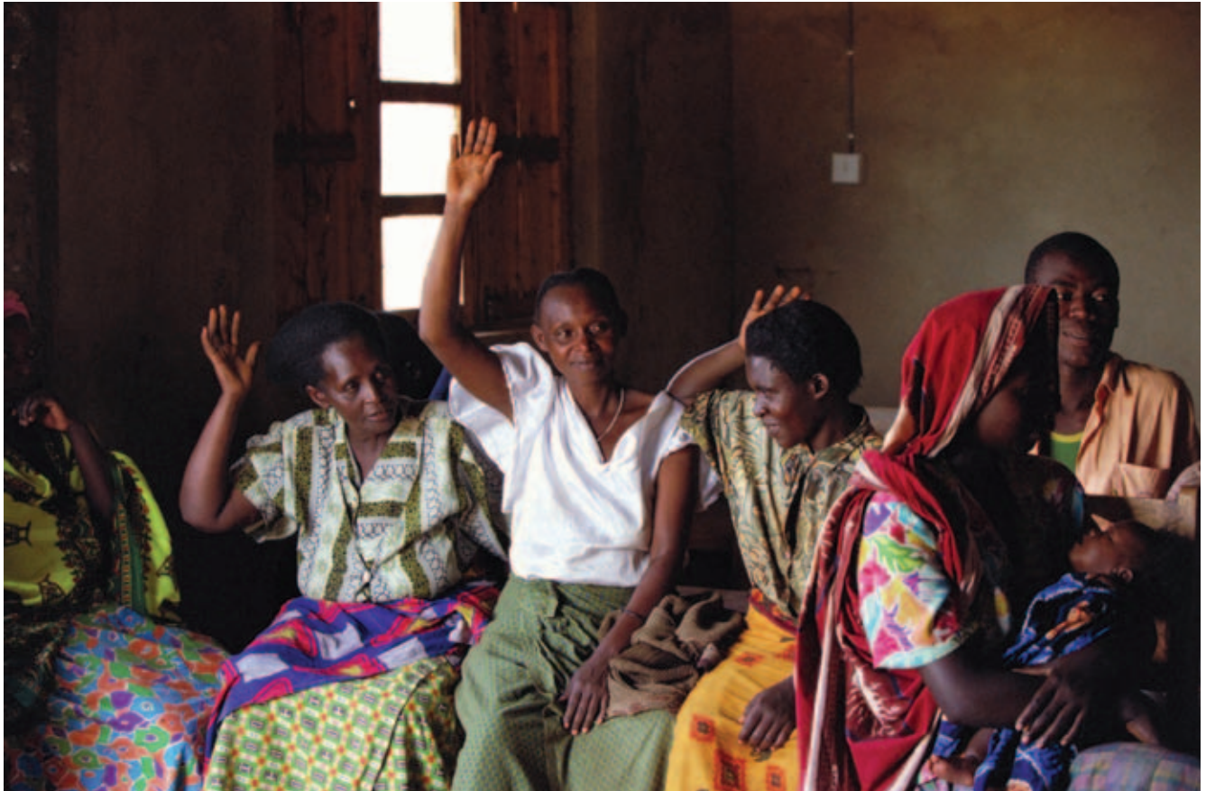
Women participating in a community meeting.