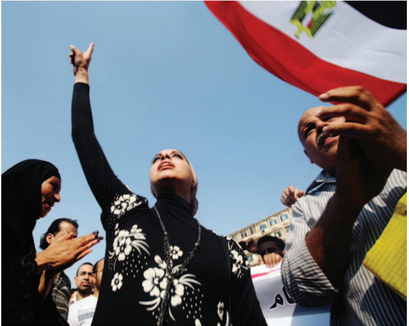
Egyptian women on Tahir Square during a protest against the Military Trial for civilians.