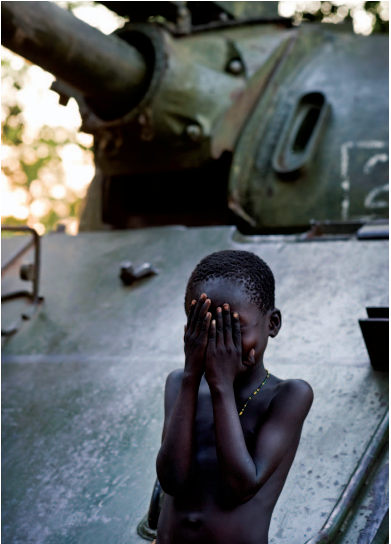
Child in South Sudan playing with the tank left behind from the civil war that ended with the signing of the Comprehensive Peace Accord from 2005.