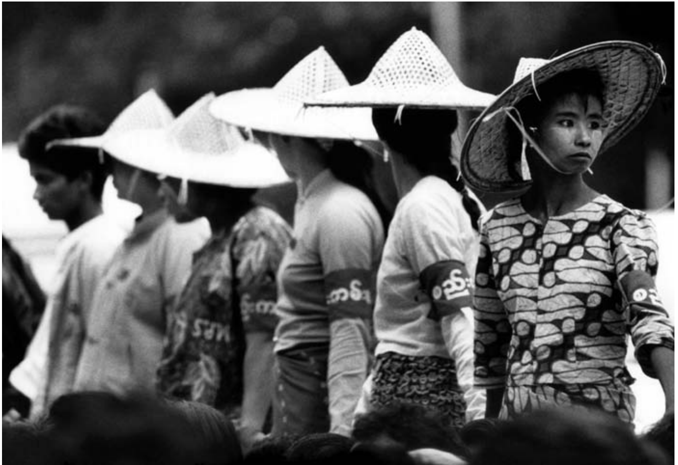
National League for Democracy youth members (Aung San Suu Kyi's party) keep order as crowds come to hear Aung San Suu Kyi at her gate to talk to her people on University Avenue. The junta did not to close the road for these addresses and the NLD was careful to ensure the traffic was not impeded giving an excuse for the junta to close these meetings down altogether. July 1996.