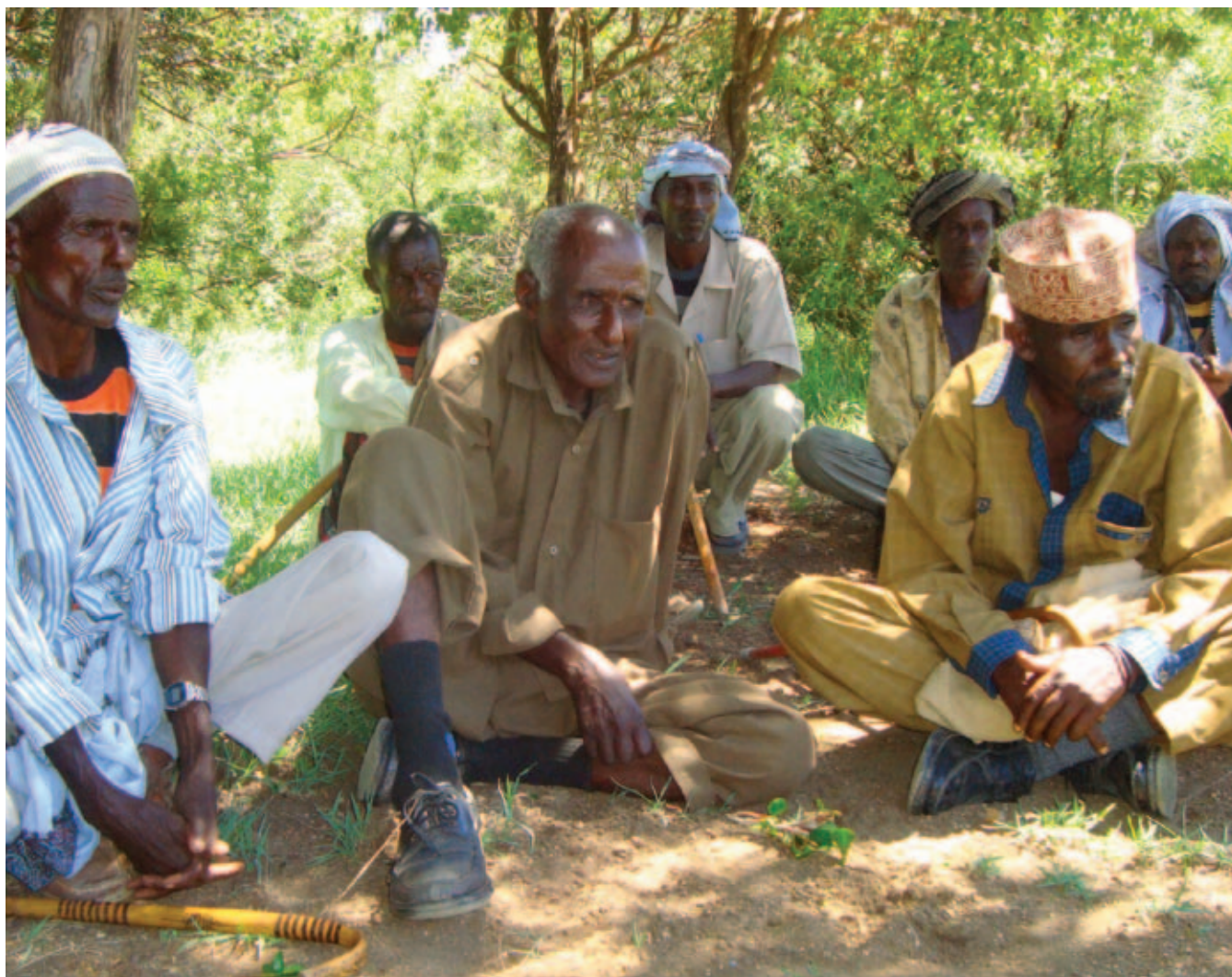
Somali men and youth join together for a community meeting.

the key players at local, national and global levels in order to empower people to make positive change is also vital. It is furthermore imperative that this is done from a rights-based approach, which takes into account the gender dimensions that form part of the violence.