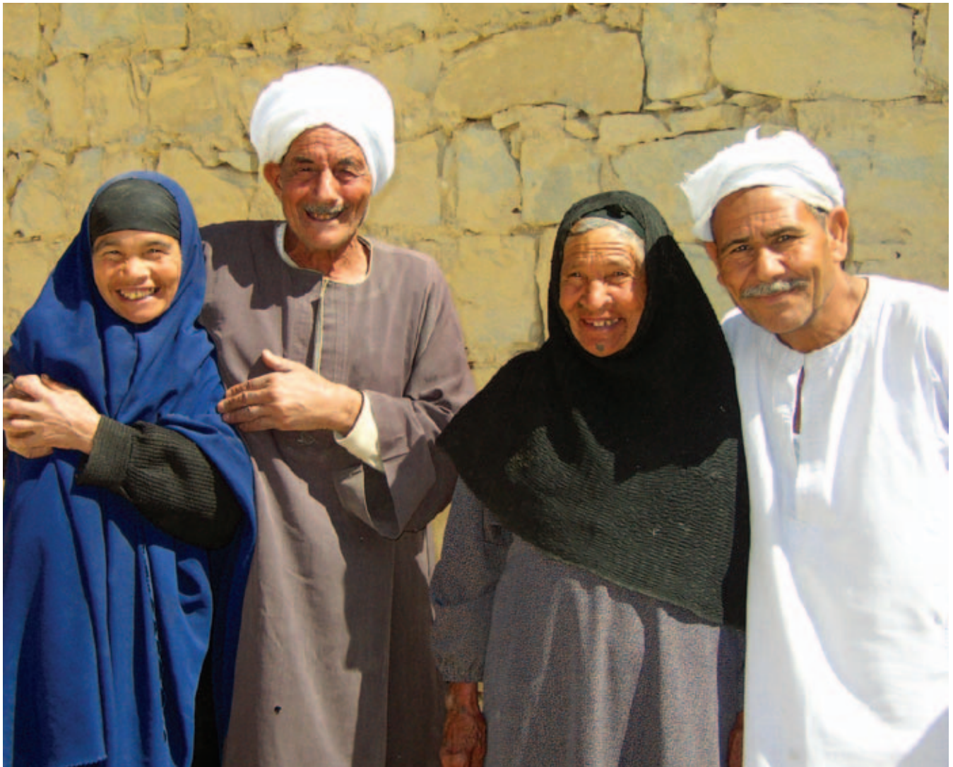
Two couples in Egypt.