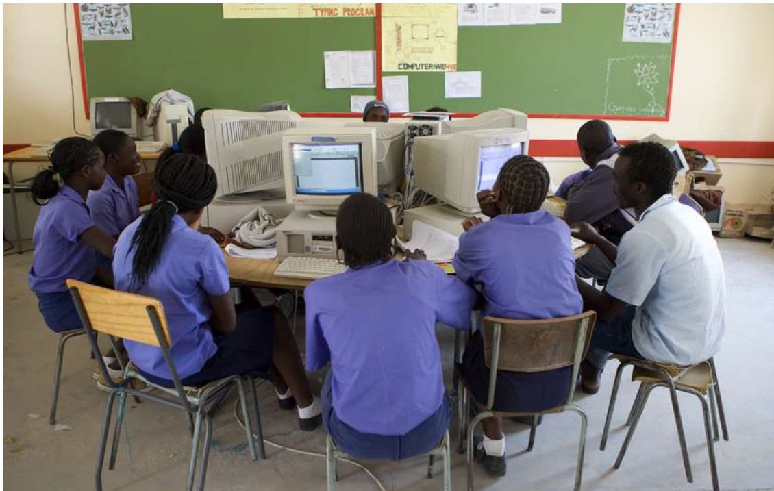
A computer classroom in Oneputa Combined School, northern Namibia. The Namibian government is committed to reducing inequality and secondary education is free for all students.

A new global ranking of governments based on what they are doing to tackle the gap between rich and poor