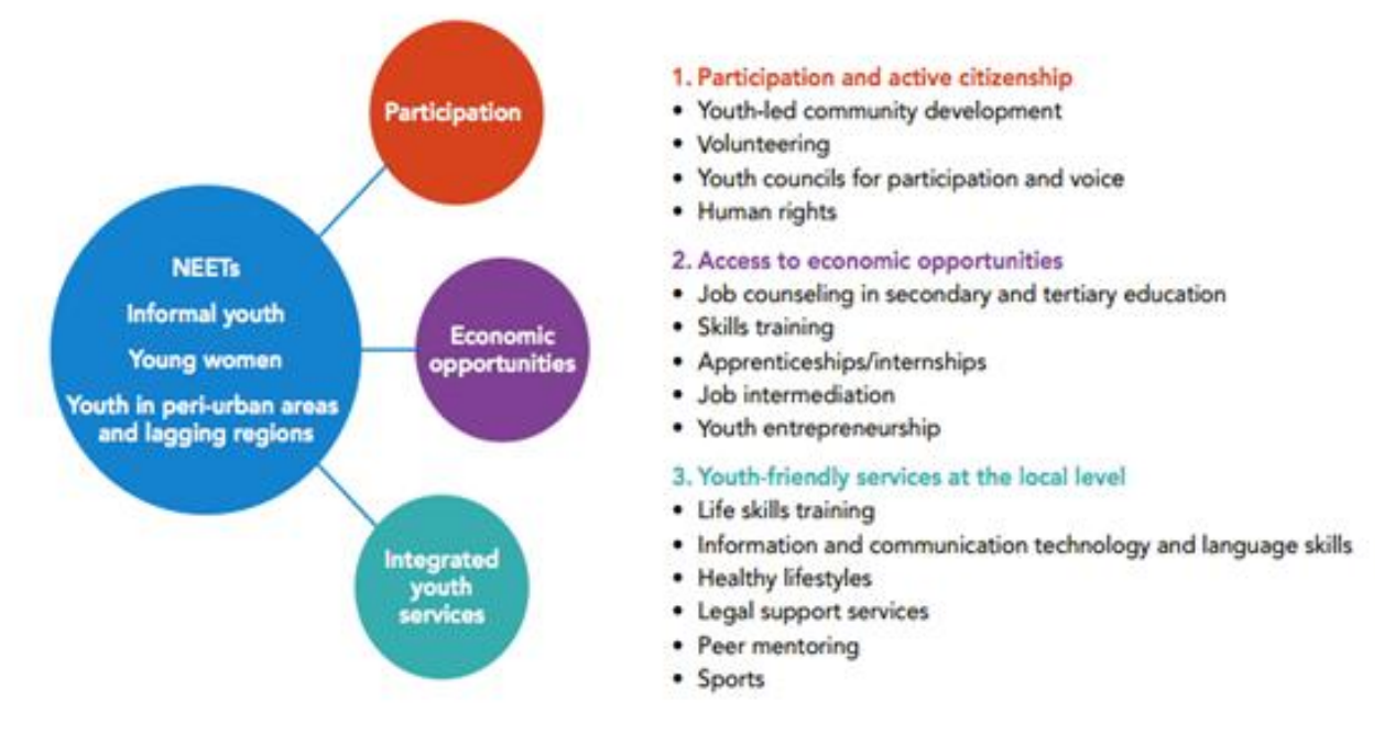
Figure 2: Multidimensional Policy for Youth Inclusion

local level. Such a holistic approach could help promote greater equity for youth and facilitate their meaningful participation in economic life.