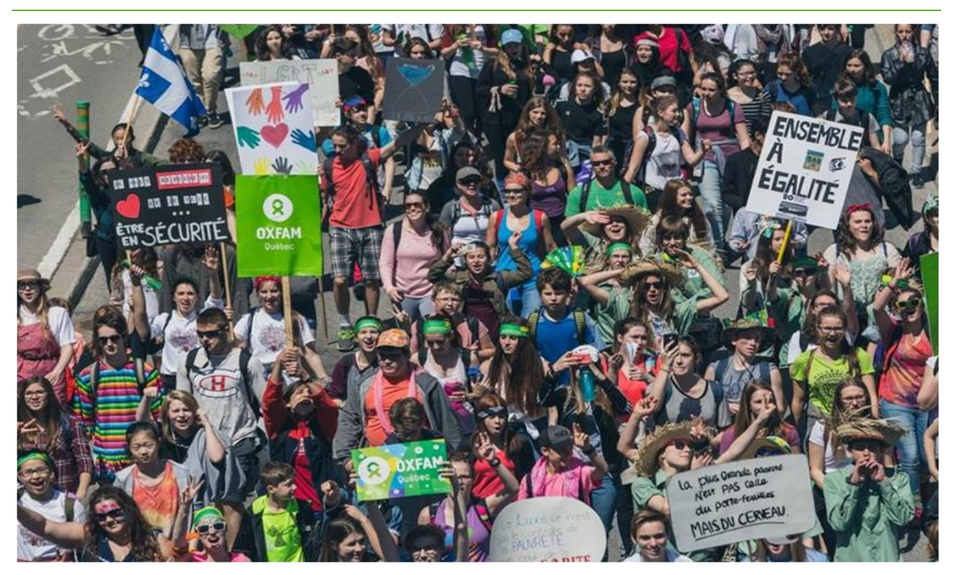
Marche Monde, Montreal 6 May 2016.