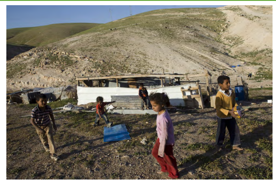
Box 1: Khan Al Ahmar - A community under threat

The village of Khan Al Ahmar is one of 20 Bedouin communities facing imminent threat of displacement. Access to the village has been cut off on all sides by the surrounding settlement and a main highway running from Jerusalem through the Jordan Valley, facilitating travel and tourism from Israel to the Dead Sea.