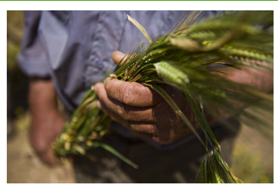
Box 2: Turning off the taps in Al Auja

A Palestinian farmer harvests barley. Without adequate access to water Palestinian farmers are mostly planting rain fed grains.