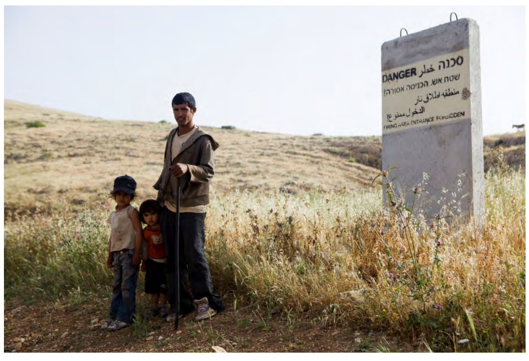
A Palestinian family in the Jordan Valley. They are unable to graze their animals because the land has been designated as a closed Israeli military zone.