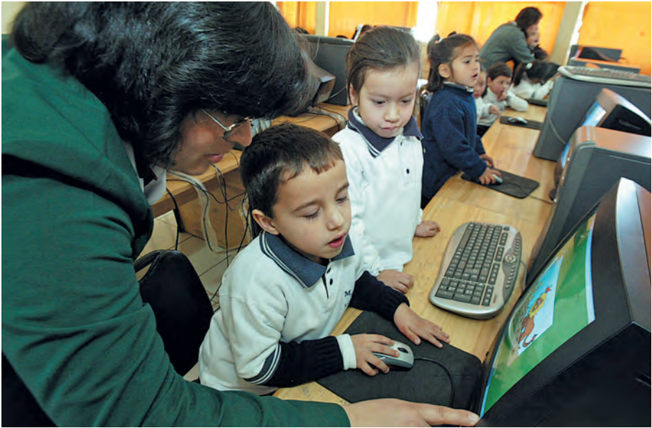
Teachers with ICT skills are crucial in preparing children for the future (Chile)

concept of teacher education; one that stood in open contradiction with the modern professional concepts of the time. 216 The incongruence of this measure and the protests of those concerned made the military authorities retract and in 1987 they reconverted two of the Higher Academies that had belonged to the University of Chile into pedagogical universities. Some years later, with the enactment of the Organic Law of Education (1990), teacher education regained its status as a university career. Currently, universities offer programmes leading to a Licentiate degree as well as a teaching qualification. A small number of professional institutes are allowed to prepare teachers and grant a professional qualification, but not a degree. 217