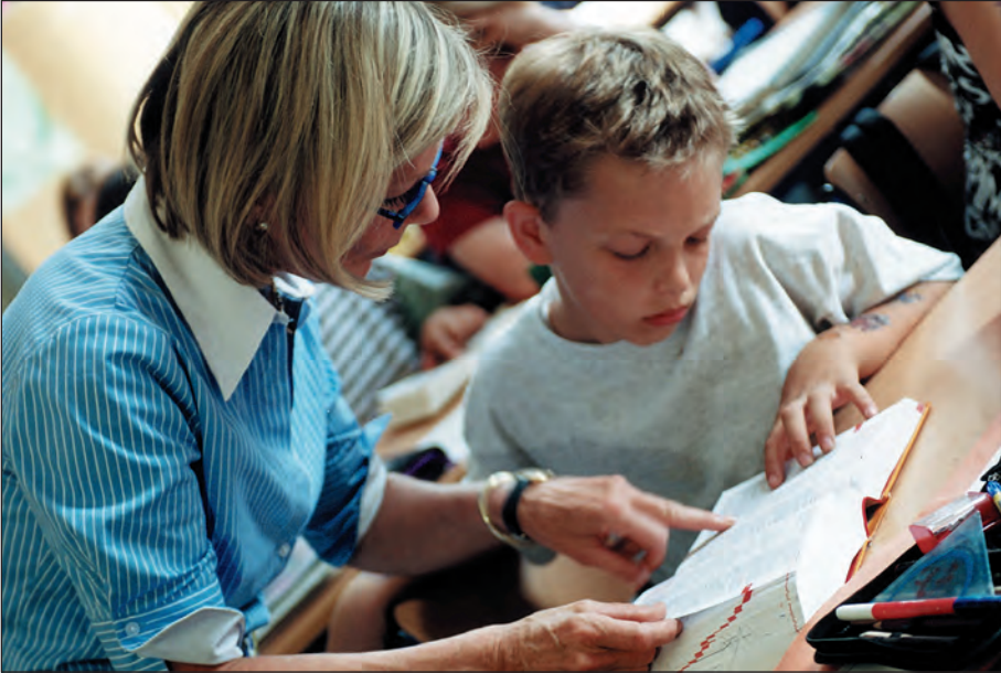
For qualified teachers the child is central in the education process (The Netherlands).

The first phase ended in April 2002, when the first version of the proposal for competence requirements was handed to the Minister of Education at the time. This version was published on the SBL-website and widely spread amongst the professional group of teachers in the form of a CD-rom and a video documentary. The video film was shown to groups of teachers, who then exchanged ideas, at hundreds of meetings (workshops, conferences, seminars). At SBL's request 15,000 copies of the CD-rom were distributed. 251 An SBL stakeholder states during an interview that although CD-roms were distributed throughout the country, not all teachers have received one. "That was a logistical problem," she says. "But I believe that everybody has also his/her own responsibility to get to know the law."