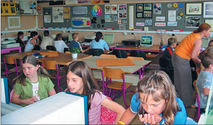
Teacher competence: make individual teaching possible in a group dynamic (Slovenia).

constitution, European legal system and national and international acts on human and child rights. 269