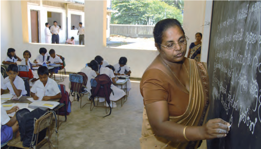
Effective teachers love their job and working with children (India)

For example, the 15 assessment criteria of a teacher training institution in the South District of Delhi are: