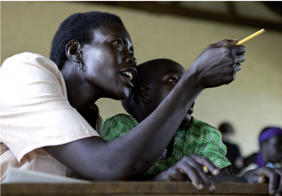
Competent teachers give individual attention to students, help them discover and learn (Uganda)

Basic Minimum Requirement Standards (BRMS); school mentoring programmes; the Quality Enhancement Initiative; an induction curriculum for new teachers; Customized Performance Targets for the head teachers and their deputies; a new teacher training curriculum at primary level; a revised Scheme of Service; and a new thematic curriculum, focusing on learning in children's mother tongues rather than English.