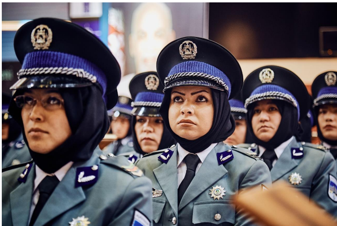
250 Police women return from their training in Turkey by UNDP / Igor Ryabchuk / 2017