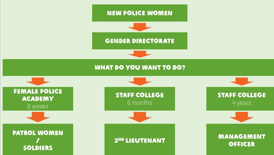
Figure 2: Training options for new female recruits offered through MoI

Training opportunities for policewomen in Afghanistan vary according to levels of entry. Most trainings focus on technical skills, rather than soft skills such as leadership and communication. The Directorate of Human Rights, Child Rights and Gender has a central role in assigning policewomen to trainings that best fit their career aims and abilities, while WPSO supports the rolling out of trainings. Figure 2 shows the training options new female recruits get offered through MoI and figure 3 shows the additional technical training the Safhe Jaded project is supporting. Additionally there are trainings available through the international community, like a police training in Turkey, funded by the Japan International Cooperation Agency and training from CSTC-A and UNDP/LOFTA.